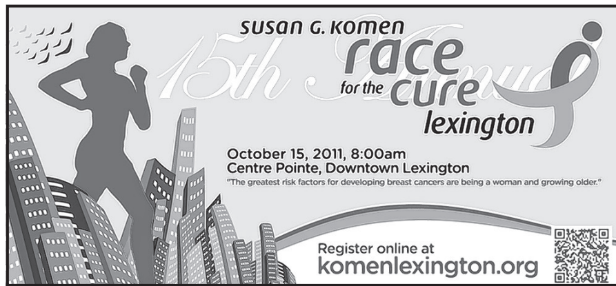
The new billboard designed and donated by Fushioncorp Design is part of the new materials created for Lexington's affiliate of the Susan G. Komen Race for the Cure.

"Everything they've made is really fresh and really exciting," she added. "They've made our materials so beautiful that I feel like it's very feminine